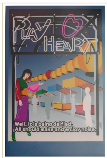
Turn on and off type : off

Radiation theory is as same as EL : Electric luminescence., but, We add the second process To this, it gets more bright than EL.